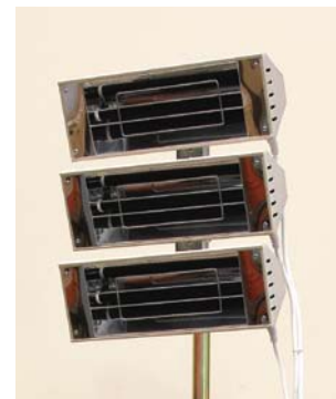
3 x HLX15 - 4500 W, 240V Requiring WXTB Mounting Bracket

All dimensions and weight nominal. Electricity supply 240v single phase + earth or 415v 3 phase + neutral. All heaters must be adequately earthed. For multiple installations the use of a qualified electrician is recommended. All models are supplied with a mounting bracket to enable heat to be directed where required. Average lamp life 7,000 hours. All HLX models are pre-wired ready to install with 240v 1500w ruby quartz lamps as standard.