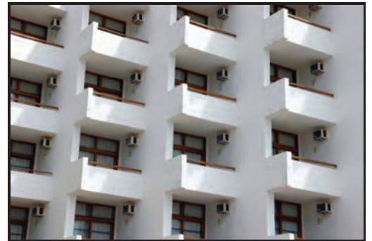
Ideal for High rise buildings with limited space

The Evapodry tray conforms to health and safety standards in accordance with Plumbing Industry Commission - Section 7 part E.